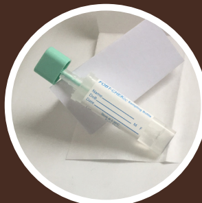
Collector Sample Non-invasive

Technology based on the immunological screening method for hemoglobin in stool , that allows for a timely, rapid, and economic detection of CRC, before symptoms appear, decreasing the mortality rate and avoiding false negatives or false positive results.